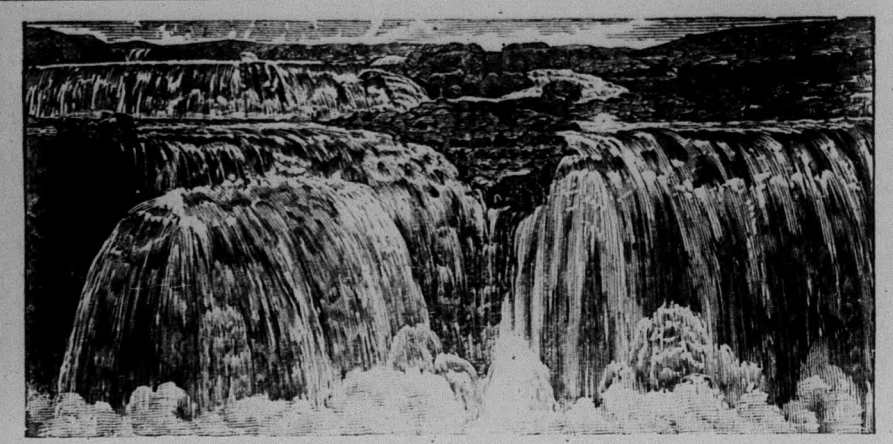
FALLS OF THE SIOUX RIVER AT SIOUX FALLS, DAK .- 91 FEET.