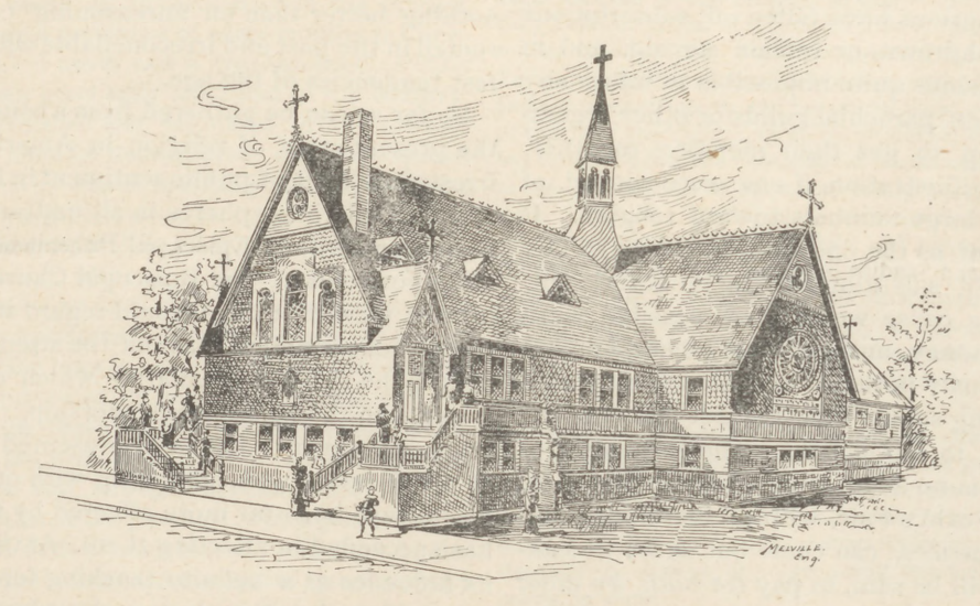
COMPLETED, SEPTEMBER 23, 1893. OPENED, SEPTEMBER 24, 1893. BURNED, SEPTEMBER 25, 1893.

Such, in a few words, is the history of the new St. George's church at Grand Crossing, Chicago. But back of this is a story of struggles, and difficulties overcome, which should appeal to every Churchmen, and bring relief in the present troubles. St. George's is the only Episcopal church in the city of Chicago, south of 67th street, in a district numbering upwards of 100,000 souls. Its congregation is drawn from Grand Crossing, South Chicago, Pullman, Park Manor, Brookline, and the neighboring suburbs, principally working men and their families.