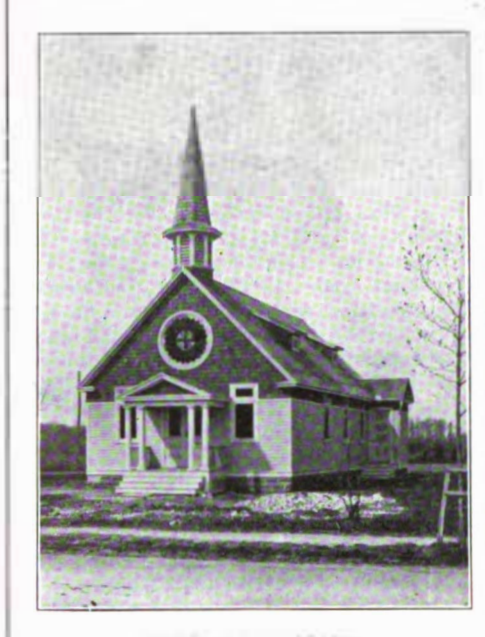
CHAPEL AT ROOSEVELT.