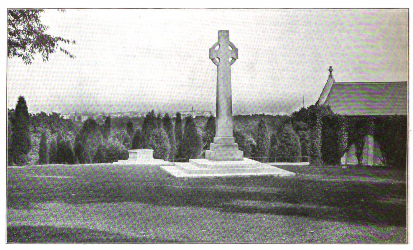
THE "LITTLE SANCTUARY," CATHEDRAL CLOSE, WASHINGTON, IN WHICH RESTS THE BODY OF THE FIRST BISHOP OF WASHINGTON.