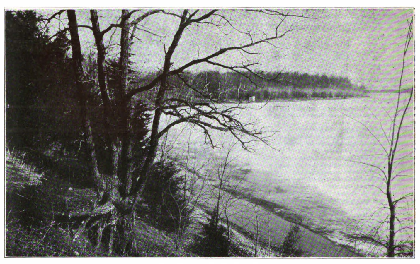
THE LAKE-LATE IN THE AUTUMN.

When competition along every line is so great as it is