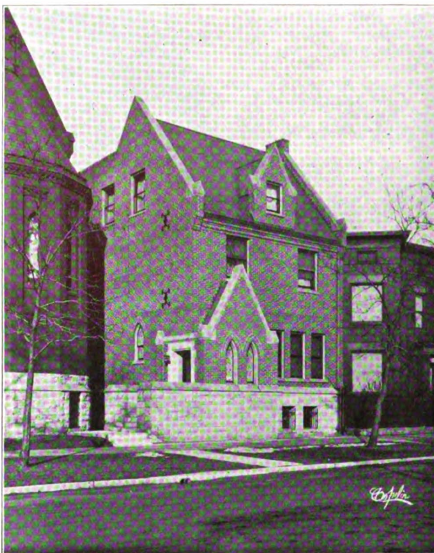
THE DEANERY, WESTERN THEOLOGICAL SEMINARY, CHICAGO.