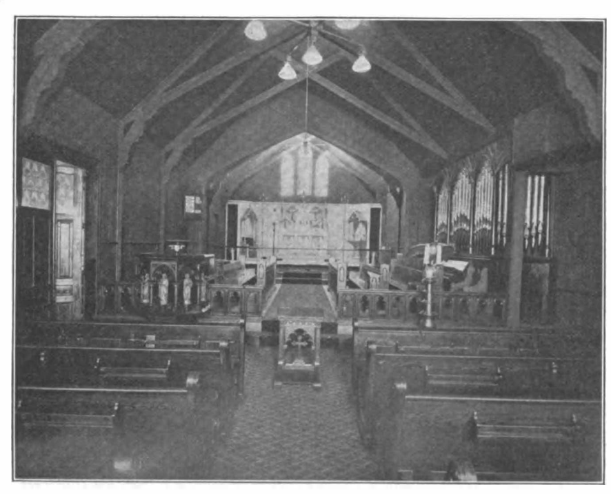
CHURCH OF THE MESSIAH, ST. PAUL. [For description see Living Church, November 12, page 62.]