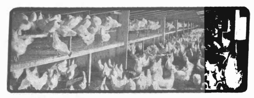
Main laying house, with 1500 pullets always at work, shelling out eggs by the bushel.

The Corning Egg-Book is valuable especially because it shows how ordinary, every-day people, without large capital or special training, but with "gumption" and industry can make money in a business that can be carried on anywhere. Egg-raising is much simpler than poultry-raising. The hard work of killing, dressing, and marketing fowls is left out. The rest can be done by men in poor health, women, school-boys, girls, and others not qualified for regular business. Corning Methods have proved successful on both a small and a large scale. For fresh eggs there is a ready mar-