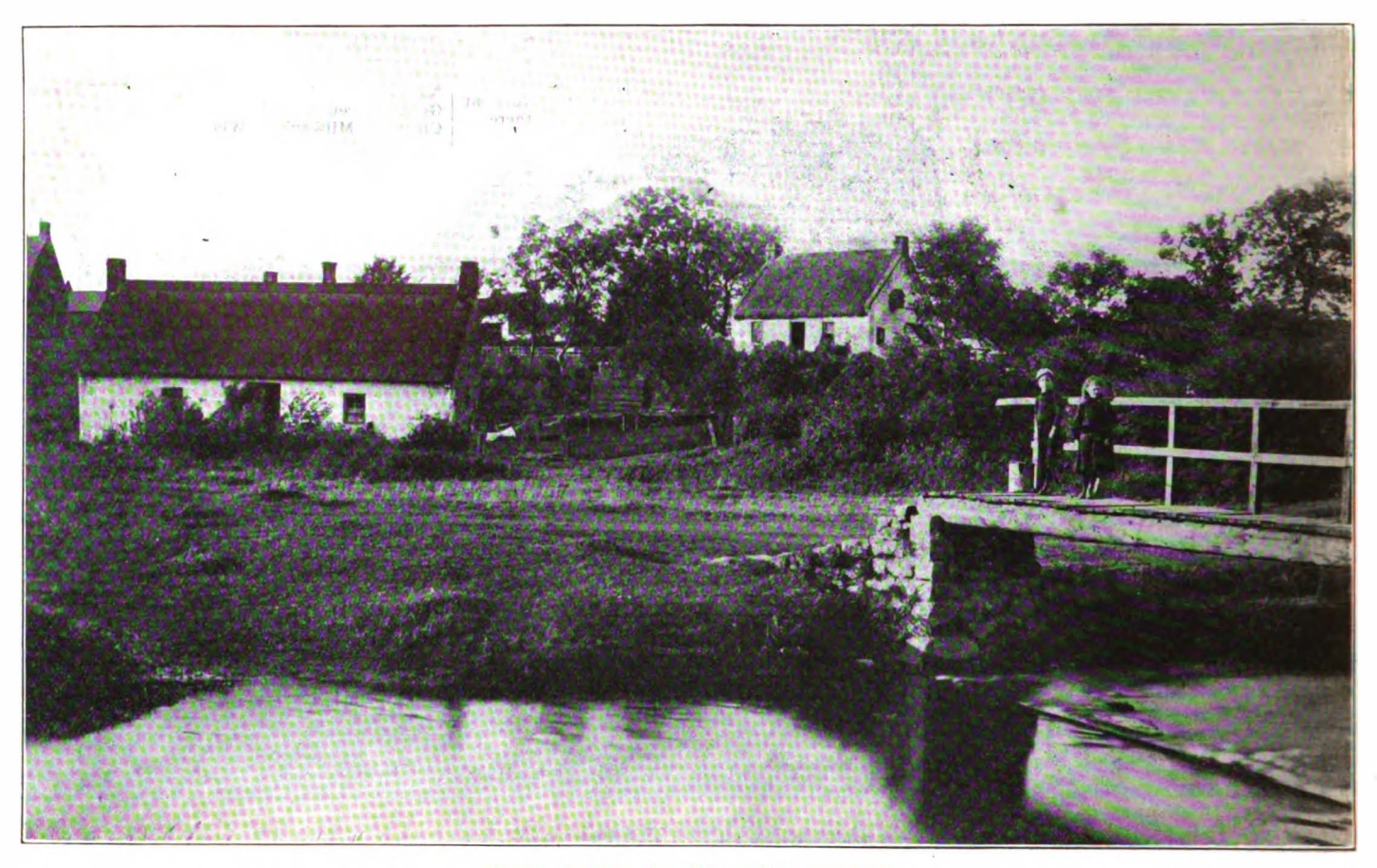
KING'S HOUSE, MILTON, NEAR STIRLING.

A FEW years ago, when an aged clergyman passed away, it was found that he had tied up his manuscripts during his years of retirement, had filed them all neatly away, and on a piece of cardboard at the top he had written this question in a bold hand: "Where is the influence of these sermons I have preached all gone to?" Then below this question there was underscored the one word, "Over." When his children after his death reverently turned the cardboard over they found this as the aged clergyman's answer: "Where are last year's sun rays? Gone into fruitage and grain and a thousand products of nature, which blessed for the time and still bless in their stored-up vigor and healthfulness. Where are last year's rain drops?