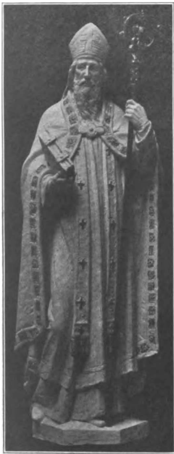
STATUE OF ST. PAUL, St. Paul's Church, Brooklyn.