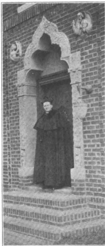
ENTRANCE TO ST. ANDREW'S HOUSE, BROOKLYN.