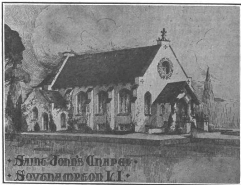
THE NEW ST. JOHN'S CHURCH, SOUTHAMPTON, N. Y.