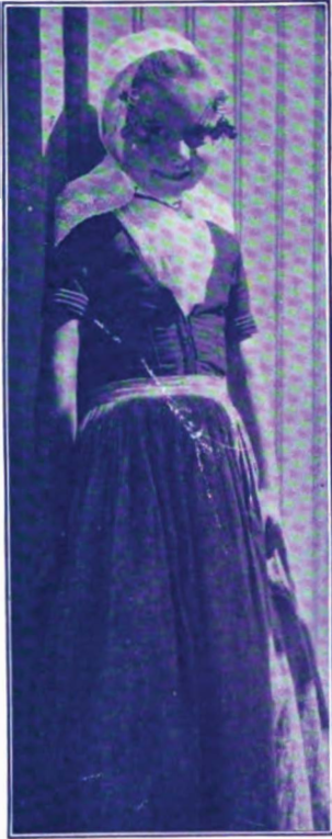
“GREETING, MIJNHEER” [FROM TRAVEL PICTURES.]