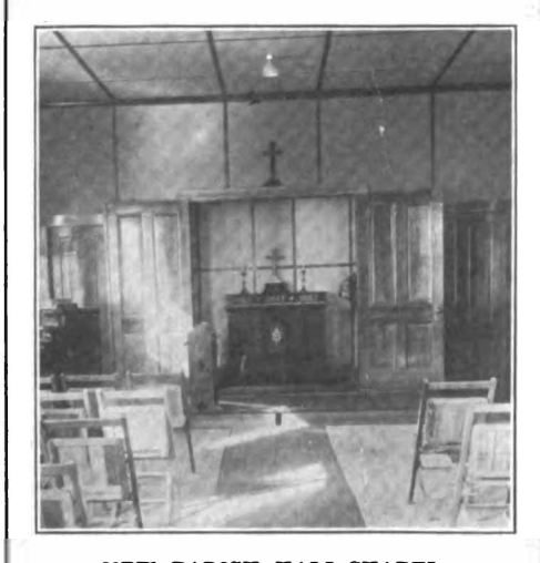
NEW PARISH HALL-CHAPEL, ST. STEPHEN'S CHURCH, PITTSFIELD, ILL. [Showing novel device for closing the sanctuary from the hall.]

For many years it has been the desire of several workers of the parish to have a hall wherein Sunday school, guild meetings, and social events might be held. The hall was further designed with the view of affording