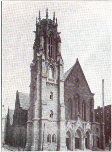
CHRIST CHURCH CATHEDRAL, ST. LOUIS, MO. (Showing the new porch and tower, which, with the peal of bells, were blessed on Easter Day.)