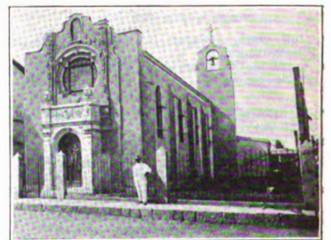
ALL SAINTS' CHURCH, GUANTANAMO, CUBA

ON MAY 12TH the Bishop of Cuba consecrated the beautiful Church of All Saints in Guantanamo. This is the building which was the gift of a Philadelphia Churchman, the opening of which was described some time ago in these columns. It is built of concrete, in the Spanish Mission style, with the usual highly decorated facade, and its open campanile, in which is a very old and historic bell, which was used many years on a planta-