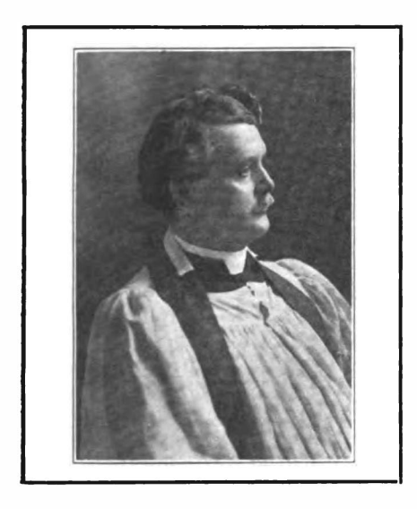
REV. WM. CABELL BROWN, D.D. Bishop-elect of Cuba

Several measures affecting the standing of Suffragan Bishops were introduced, but all met with defeat. In the House of Deputies it was proposed to make it possible for a Suffragan to be the rector of a parish or the minister in charge of a mission, also to make it possible for a missionary district to have a Suffragan Bishop. As the former was defeated the latter was withdrawn. In the House of Bishops it was proposed to give the Suffragan a vote as well as a seat, but without success. It was also proposed to make it lawful for a diocese to con-