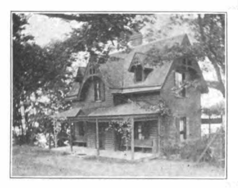
G. F. S. HOLIDAY HOUSE OF WESTERN NEW YORK On Concsus Lake

THIS SUMMER is the fifth in the successful venture of a Holiday House for the Girls' Friendly Society of the diocese of Western New York and the fourth vacation spent on