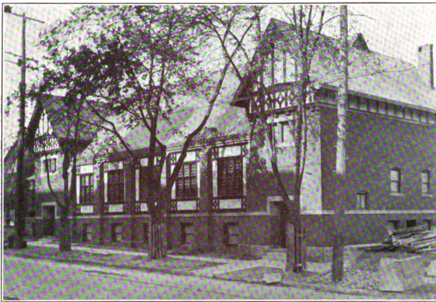
PARISH HOUSE OF ST. MARY'S-ON-THE-HILL, BUFFALO

ON SUNDAY, November 22nd, at St. Mary's-on-the-Hill, Buffalo, after Evening Prayer which was said in the Church at four o'clock, the new parish house was formally opened and dedicated by the Bishop of the diocese. The choir led by the crucifer and flagbearer in the processional was followed by the vestry-