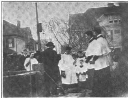
LAYING THE CORNERSTONE St. Jude's, Brooklyn