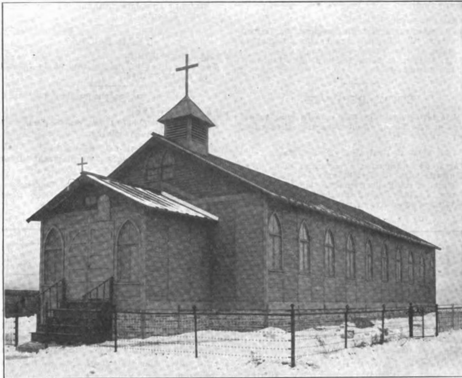
TRINITY (HUNGARIAN) CHURCH, SOUTH BEND, IND.