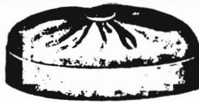
SOFT CHOIR CAPS

Made of the best materials with either Tassels or Pompons, and in all Hat sizes