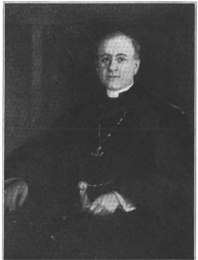
REPRODUCTION OF OIL PAINTING OF BISHOP SUMNER BY HARRIET BLACKSTONE

"The artist emphasizes the spirit of this many-sided character, and preserves for the city benefited by his broad friendship and incessant public service the image of the true apostle. It is under-