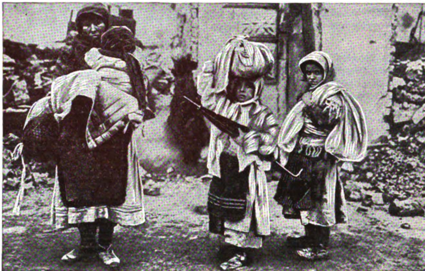
REFUGEES RETURNING TO RUINED HOMES

For months the contending armies, millions of men, have made a battlefield of Poland. The presence of these armed hosts has practically stopped industry, ended farming, put a blight upon every crop, chilled the chimneys of every home. All ambition has been stifled. All sense of security has been banished. In place of domestic peace, the simple comfort of peasant homes, the sweet happiness of childhood, the pleasant reward of neighborliness after toil, in place of all these things which make up the sum of human happiness for the great majority of us, there has come to them terror, starvation, disease, wandering, nakedness, death. Poland has been beaten and robbed in order that armies might subsist and fight. Helpless and homeless, hopeless and strengthless, this high-minded, inoffensive race has come into a period of suffering beyond anything that has ever gone before in their history.