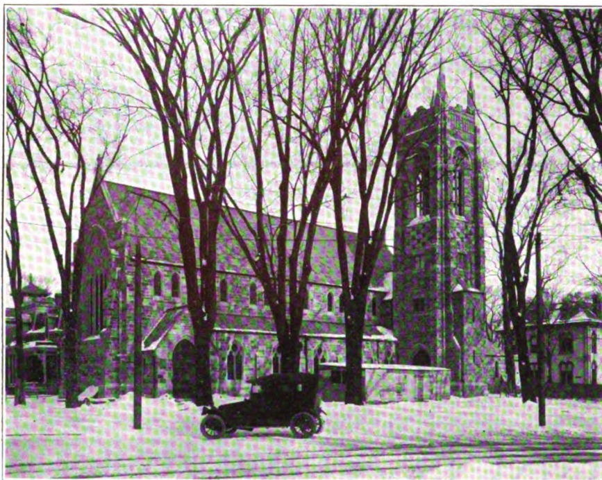
TRINITY CHURCH, SYRACUSE, N. Y.

The remittances received from churches and individuals in America since Easter have already reached over $10,000.