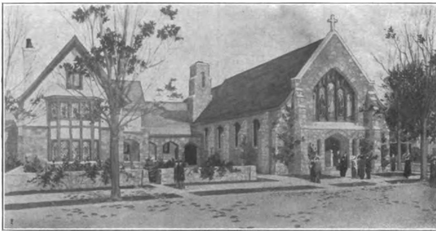
ST. JOHN'S CHURCH, WAUSAU, WIS.