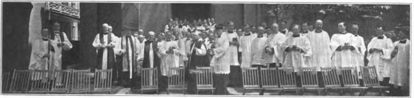
HARRISBURG DIOCESAN CONVENTION