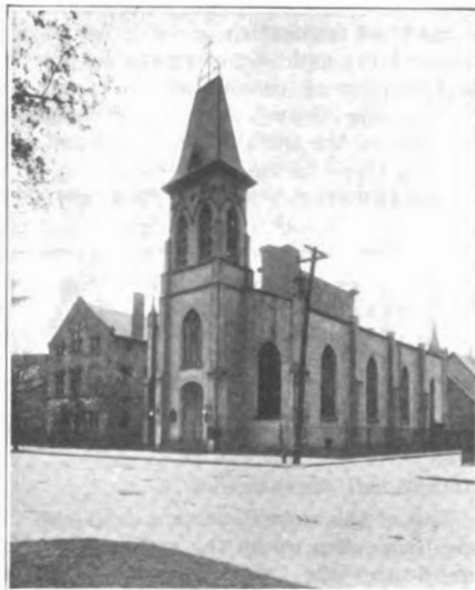
CHRIST CHURCH AND PARISH HOUSE Pittsburgh