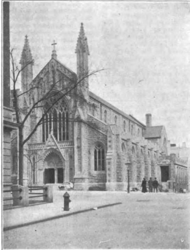
HOLY ROOD CHURCH, NEW YORK