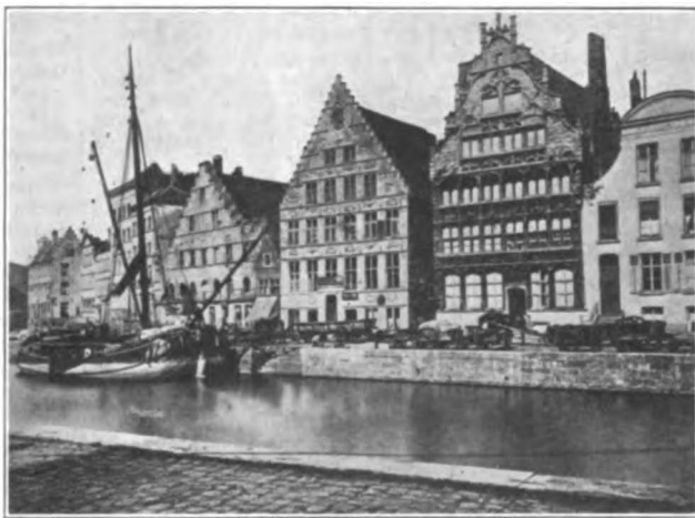
THE CANAL, GHENT

Sixty other noblemen were so influenced by his conversion that they built an abbey in Ghent, and, dedicating it to him, followed in his footsteps. Later this was destroyed by Charles the Fifth. His relics were removed to St. John's, which received his name and is now the Cathedral of St. Bavon, in Ghent. He is also the titular saint of Haerlem, as well as of the former city. The Cathedral stands on the square of St. Bavon, and, though large and massive, the exterior is plain. The west portal was defaced during the French Revolution, but has been restored. The statue of the saint, with the falcon (his emblem) and the sword and book, indicating that he was both duke and monk, has been replaced, and now stands beside one of the Christ. This church possesses many fine paintings, the most important of which