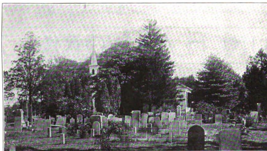
ST. JAMES' CHURCHYARD Piscatawaytown, N. J.

Certainly not in many years have the trustees listened to a financial report which did not close with the statement of a deficit. This year reversed that experience. In an institution which offers to all students tuition without charge, and in addition makes every year generous grants in the way of scholarships to meet the need of students for their living expenses while studying at the House, there must be a heavy demand upon the treasury, and the income from invested funds, with a small amount in students' fees, has never been sufficient to meet this demand.