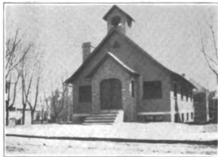
ST. MARY'S CHURCH, WAYNESBORO

When the mission was begun there were less than a dozen members in the place. Now