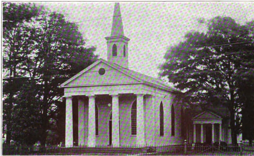
ST. JAMES' CHURCH AND PARISH HOUSE Piscatawaytown, N. J.

"Resolved, That the adoption of this resolution be communicated to the chairman and secretary of the above joint commission of the General Convention."