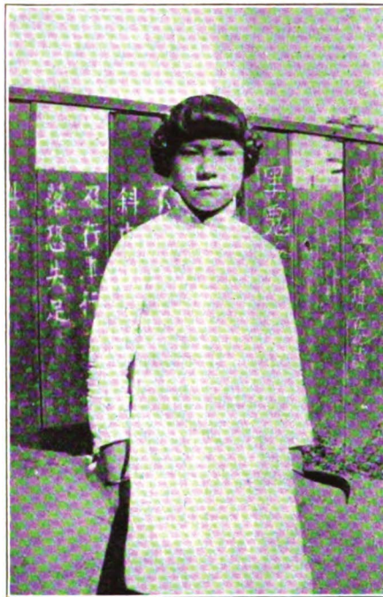
ONE OF FR. NG'S CHILDREN

Of the Exposition I shall write later, as of that in San Diego. But San Francisco has its own beauty-spots close by, other than the Fair. Golden Gate Park is exquisite, with the Prayer Book Cross for its chief ornament, commemorating that