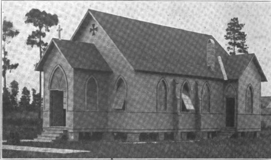
IMMANUEL CHAPEL, BAY MINETTE, ALA.