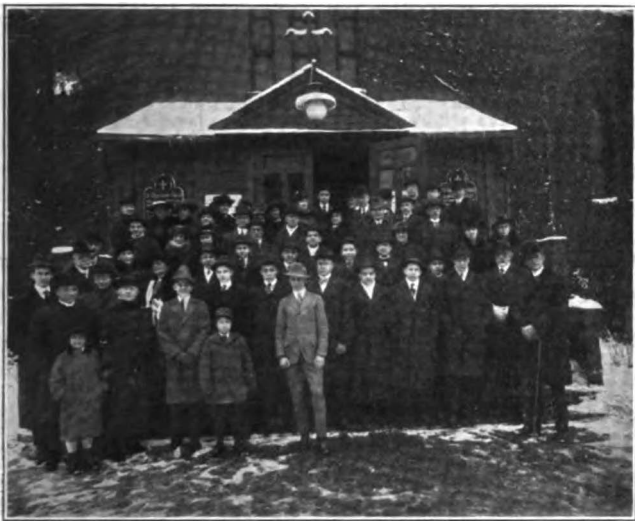
HELPERS IN THE EVERY-MEMBER CANVASS St. Chrysostom's Church, Chicago

and the dioceses of the Province of Sewanee. He replied that the success of the movement is due to the fact that the average man is more interested in God than he is in anything else. The aim of this movement is to lift up God, revealed in Jesus Christ, before the eyes of Churchmen; to lift Him up so that they can see Him at work, not as a Protestant Episcopal, or a diocesan or a parochial God, but as the God of all the earth, with no competitors, but Himself interested in and using not the Church only but every victorious force and agency, including business, for the regeneration of the whole world. He wants to use His chosen Church if it will let Him. If it will not, He will use anything else until the Church repents. Men make great sacrifices for great causes, because great causes command great enthusiasms. But a cause, however great, never attracts enthusiasm until men know about it. The enthusiasm always seen in this movement is the direct and necessary result of merely telling the facts to people who do not know them. After a period of three weeks preparation in prayer and organization so that they will come out to hear these facts, the facts are told to them, and enthusiasm follows. After people's interest is awakened by the attractive power of God as He is working in the world to-day, an organized opportunity is given to all to share with our Lord through the Church in a practical way in the work He is doing.