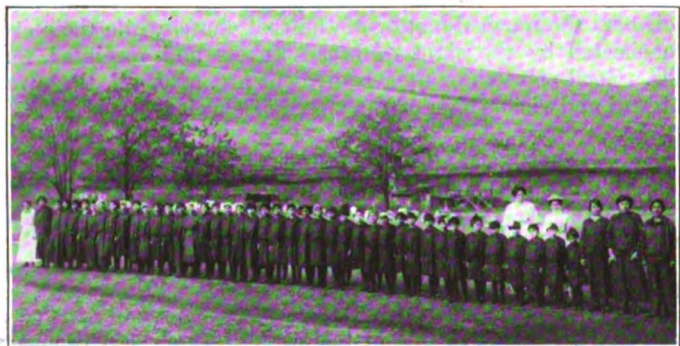
GIRL PATIENTS IN ASSEMBLY AT LAPWAI, IDAHO