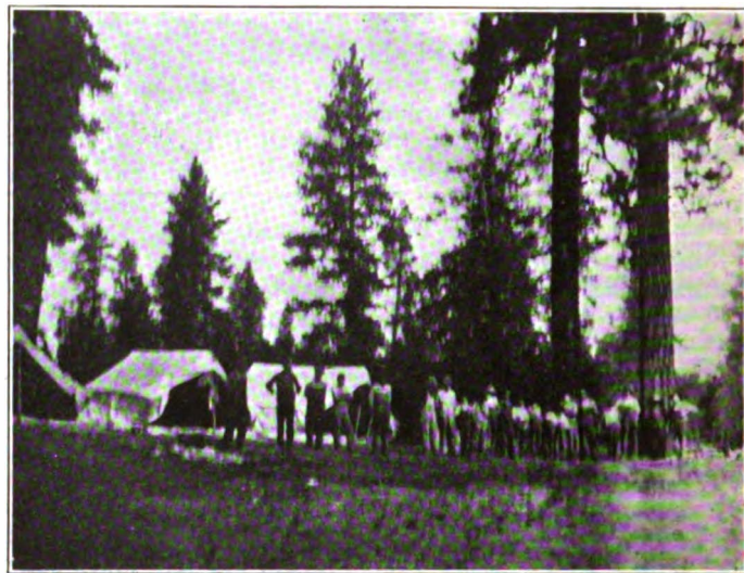
LINED UP FOR ROLL CALL AND EVENING PRAYER

The superintendent feels that the playgrounds have an important place in building up the physical forces which throw off the influences of the dread disease, but great care is used not to carry physical exercises too far. This same restriction is exercised in regard to the kitchen, the sewing room, and other industrial departments where the patients are being trained. All these good things are made subordinate to the idea of promoting health. Each pupil is carefully taught just as any thoroughly well child would be and each is made to feel that