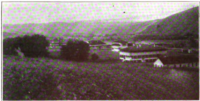
SANATORIUM BUILDINGS AT LAPWAI, IDAHO

A RE the Indian people in the United States being extinguished by disease? This is the question a good many are asking. For a time it seemed that pulmonary trouble and other diseases made the Indian people a hopeless problem. This came about largely from the fact of the changed conditions civilization forced upon a nomadic and undeveloped people. The Indians had been used to an out-door life. They had lived in tents which were well adapted to their elementary ideas of sanitation, but along with contact with the white people came the