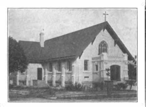
ST. MARK'S CHURCH, MEDFORD, OREGON

THE NEW St. Mark's Church, Medford, Oregon, is built of gray cement brick with white cement stone trimmings. An altar and reredos and rood screen executed by a competent woodworker of Portland will be in-