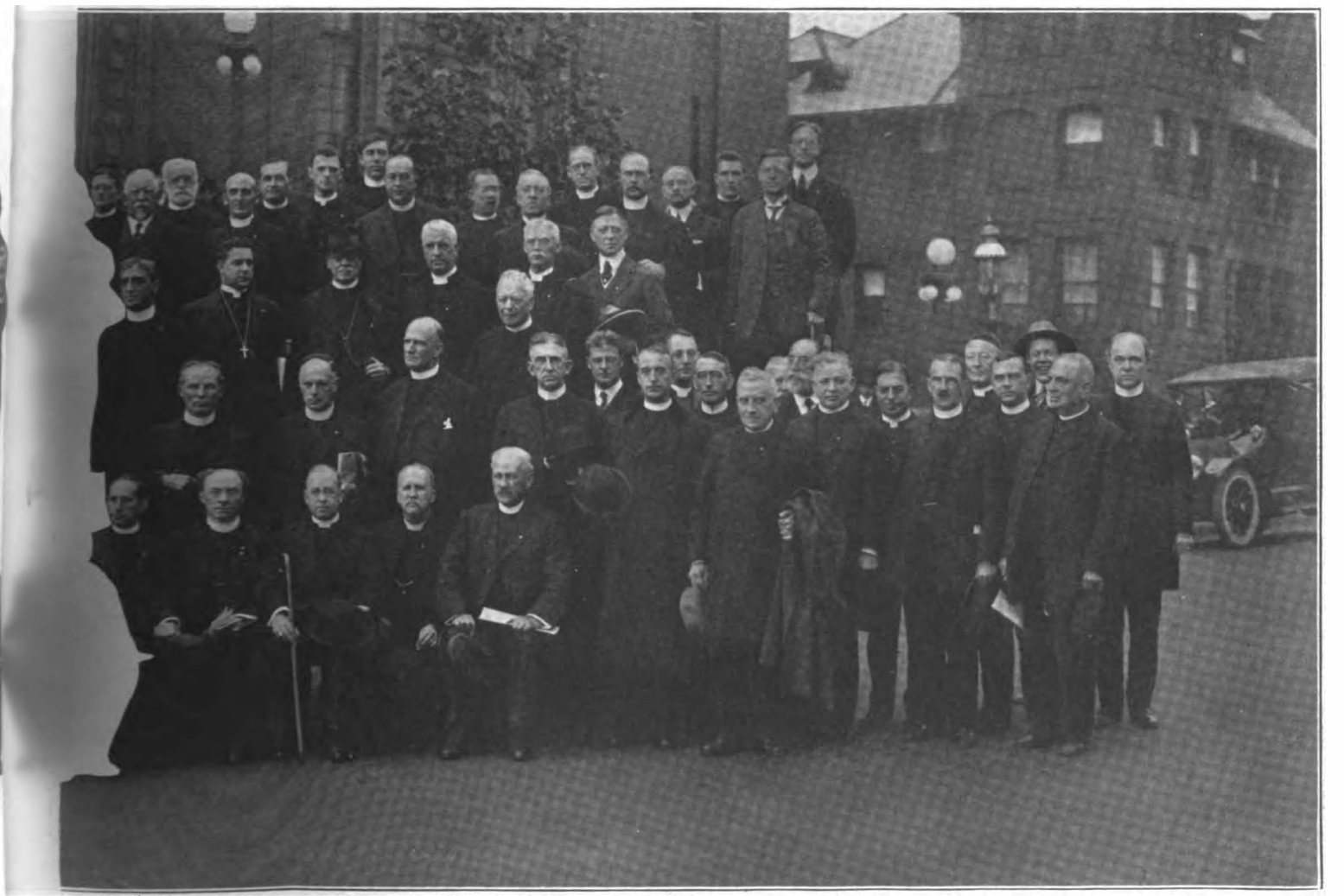
Digitized by Google

"Elected to the diocese of Missouri in 1868, but declining this