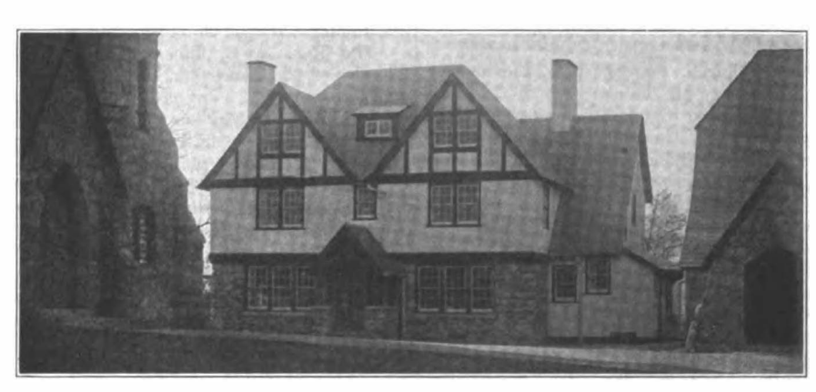
NEW RECTORY, ST. MARY'S IN THE HIGHLANDS, COLD SPRING, N. Y.

A regular weekly service in the Spanish language was begun on Sunday morning, De-