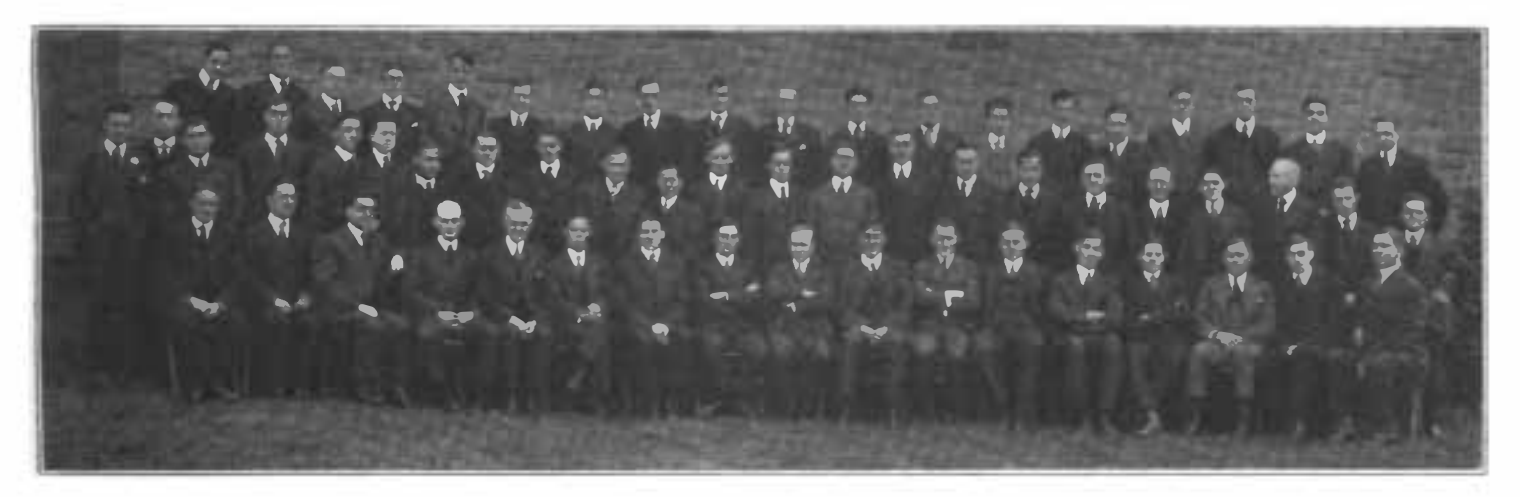
AT THE ANNUAL INTER-SEMINARY CONFERENCE, PHILADELPHIA In session December 1st and 2nd