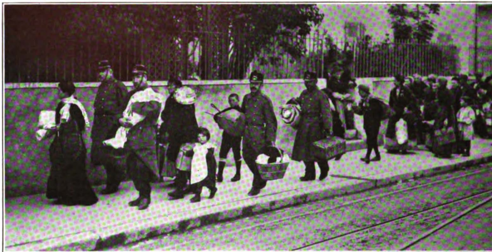
"DOWN THE LONG HILL FROM THE STATION TO THE SCHOOL"

woman loves to make baby-clothes. Dainty garments were fashioned. Many complete layettes came from America. But the peasant mothers only "took their heads in their hands," as the French say, and refused to be comforted. "Impossible to keep a baby warm or clean in such foolish clothes," they insisted.