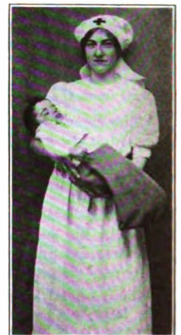
THE LITTLE FRENCH PROFESSOR

And this is how we use your money. Every garment we give is made by the poor women of Geneva. For example: An American lady sent us 250 francs ($50), saying only, "Do something for me for the refugees." The money