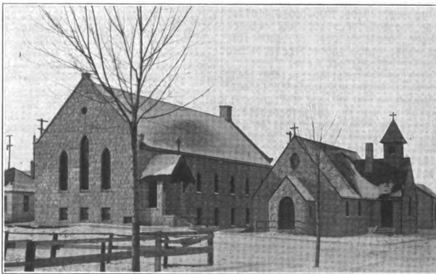
ST. JAMES' CHURCH AND PARISH HOUSE, LEWISTOWN, MONT.