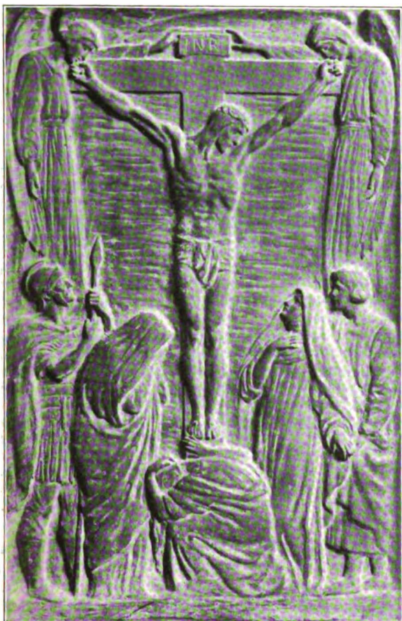
BRONZE DOOR OF TABERNACLE, CHRIST CHURCH, WOODLAWN