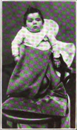
ONE OF OUR BABIES