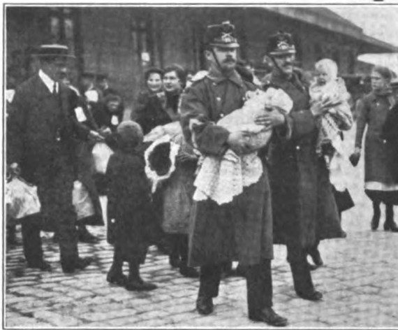
"THE GOOD PAPAS OF THE LANDSTURM"

profession. Garibaldi's daughter taught her the piano, until the pupil outgrew the teacher; and Garibaldi's daughter took her to a master—an American pianist. The master married his pupil. They were both artists. They gave concerts together. There were seven children. With seven children and the musical temperament on both sides, what can you expect? He has been dead for many years. The children are all dead, too. She is past seventy and quite alone. The grandsons who did help her are fighting in the trenches for France. She talks of the old days when she played the organ in the American church in Rome, and the American Ambassador praised her playing. She talks of the first time she heard her husband play. She is very dramatic—"My heart trembled when he played,"