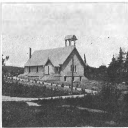
ST. ANDREW'S-BY-THE-LAKE Seal Cove, Mt. Desert Island, Maine