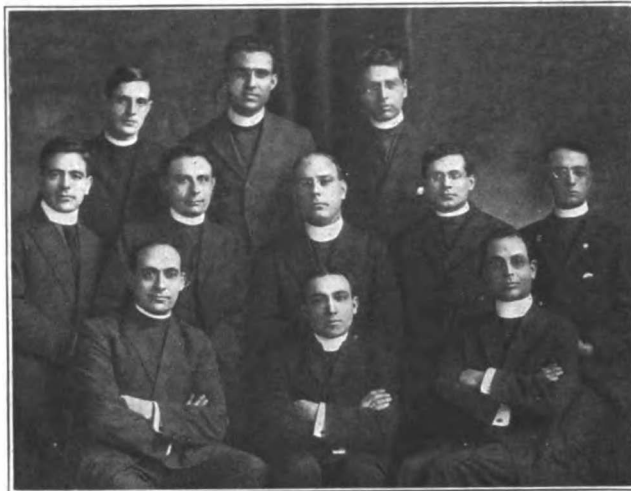
GROUP OF ITALIAN PRIESTS IN CONFERENCE AT CHICAGO

The next meeting will be held September 20th, in Christ Church, Boston, Mass.