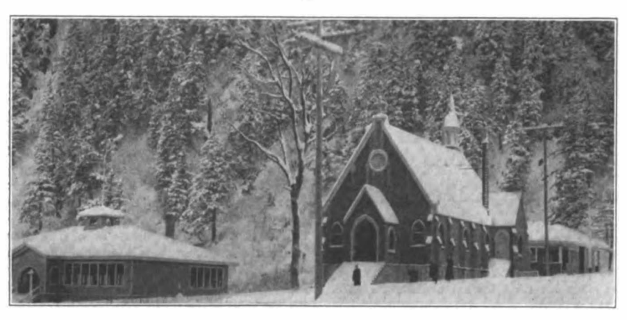
ST. PETER'S CHURCH, SEWARD, ALASKA

The first business was to hear the report