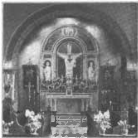
NEW ALTAR OF ST. MICHAEL'S CHAPEL, Nineteenth and Lombard streets, Philadelphia

THIS week is being observed at the Church of the Holy Apostles as a time of reunion and "get-together" of all persons who have been at any time connected with the parish. A special service was arranged for the church and Sunday