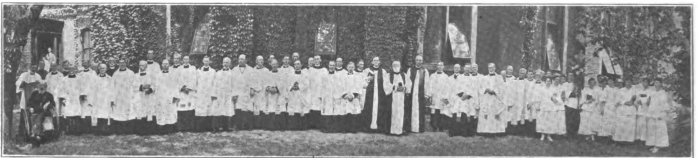
AT THE CENTENNIAL CELEBRATION OF THE FOUNDING OF THE DIOCESE OF NORTH CAROLINA NEWBERN, ASCENSION DAY, 1917

THE REV. DR. FLOYD W. TOMKINS delivered the address at the annual rally of the men's adult Bible classes of Carbon county,