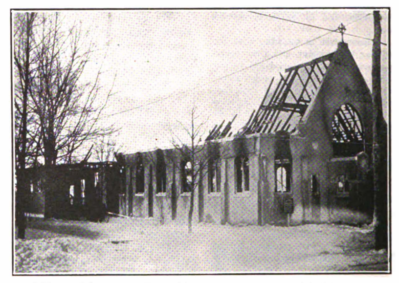
RUINS OF THE CHURCH OF THE GOOD SHEPHERD, LEXINGTON, KY.

"These things ought not so to be. The crisis of Christianity requires the subordination of all things divisive. Without prejudice to existing personal relations or official fidelities, the