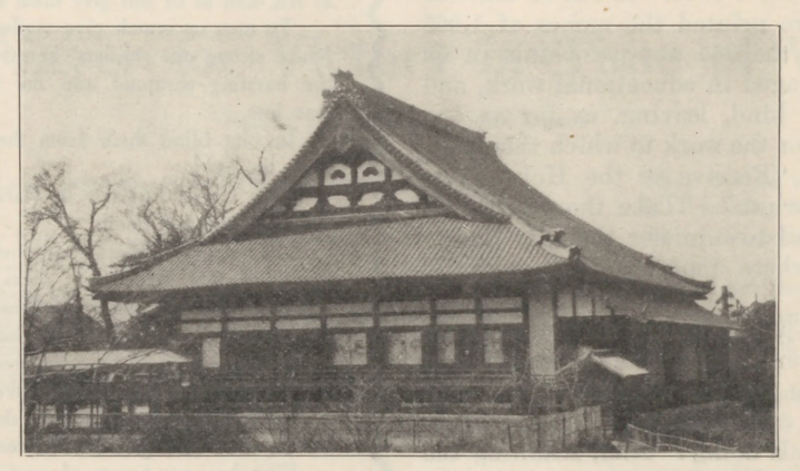
THE HANDSOME TEMPLE OPPOSITE

to meet present needs and be useful for many years to come - might be built with that amount. Alas! here as elsewhere the effect of the war is seen on everything and what could be done a year ago for $2,500 to-day costs fully $1,000 in excess; nor is there any great hope that these conditions will change, for everything has soared skyward and those whose business one may suppose it was to take account of these things seem well content that they should stay there