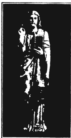
FIGURE OF CHRIST Church of St. Mary the Virgin, New York

The Church of St. Mary the Virgin is to be further beautified by the erection in the nave at either side of the sanctuary of two figures, one of our Blessed Lord and the other of the Blessed Virgin. The statues stand nine feet high on tall pedestals. They