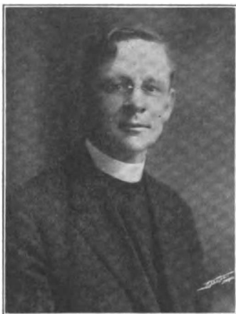
THE REV. H. H. H. FOX Suffragan Bishop-elect of Montana

The Bishop's address disclosed an increase of communicants from 4,655 to 4,709, while the Sunday schools show an increase of over 200 pupils and 45 teachers. An increase of $9,000 was given for parochial purposes, and $14,000 for diocesan purposes. Property indebtedness was reduced by $23,000 and property valuations increased by $91,000. Total contributions were increased from $89,000 to $112,000. Only in extra-diocesan contributions does there show a decrease in statistical enumeration over the previous year. The total number of baptisms was 379, confirmations 278, marriages 281, burials 291, Sunday school pupils 2,199; of churches there are 54, rectories 24, parish houses 15; property valuation is $1,154,054, total indebtedness $80,193.