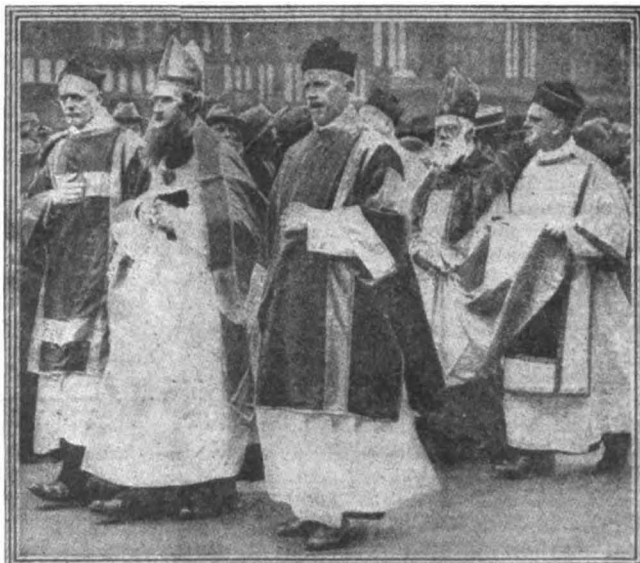
THE ARCHBISHOP OF RUPERT'S LAND [front, center]

SNAPSHOTS AT THE GREAT PROCESSION TO ST. ALBAN'S CHURCH, HOLBORN, LONDON.—ANGLO CATHOLIC CONGRESS