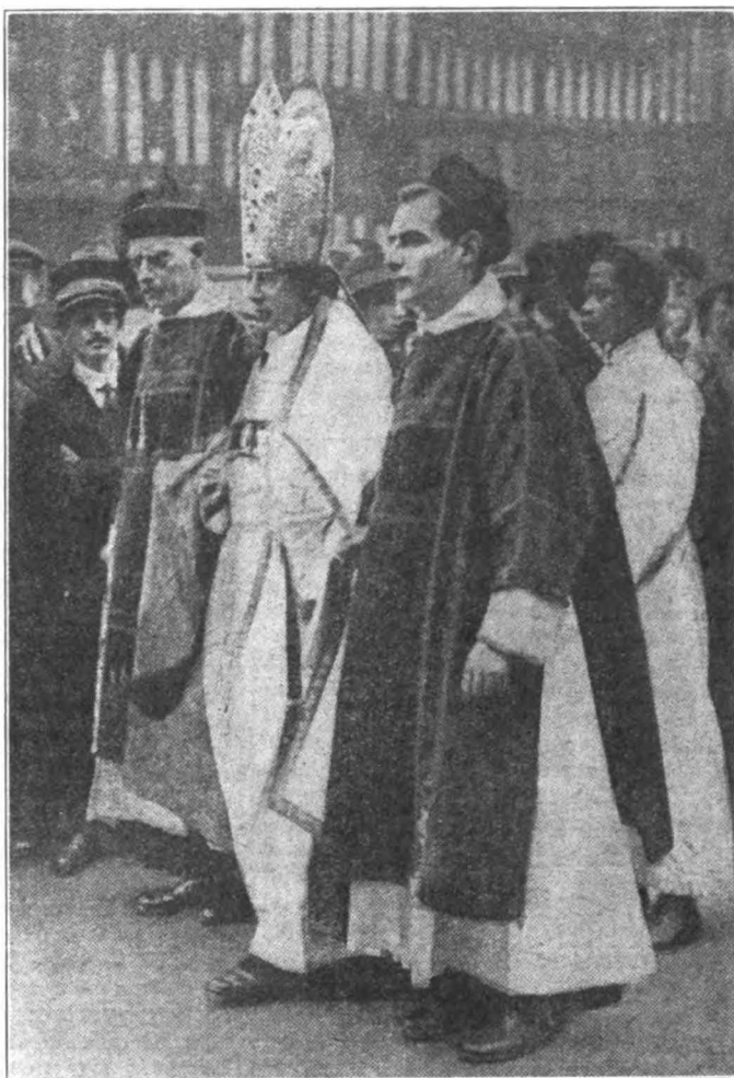
BISHOP OF ACCRA, WEST AFRICA