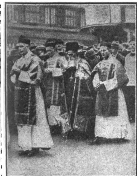
THE ARCHBISHOP OF CYPRUS (Orthodox Eastern Church)