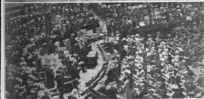
UPPER. VIEW OF THE GREAT PROCESSION