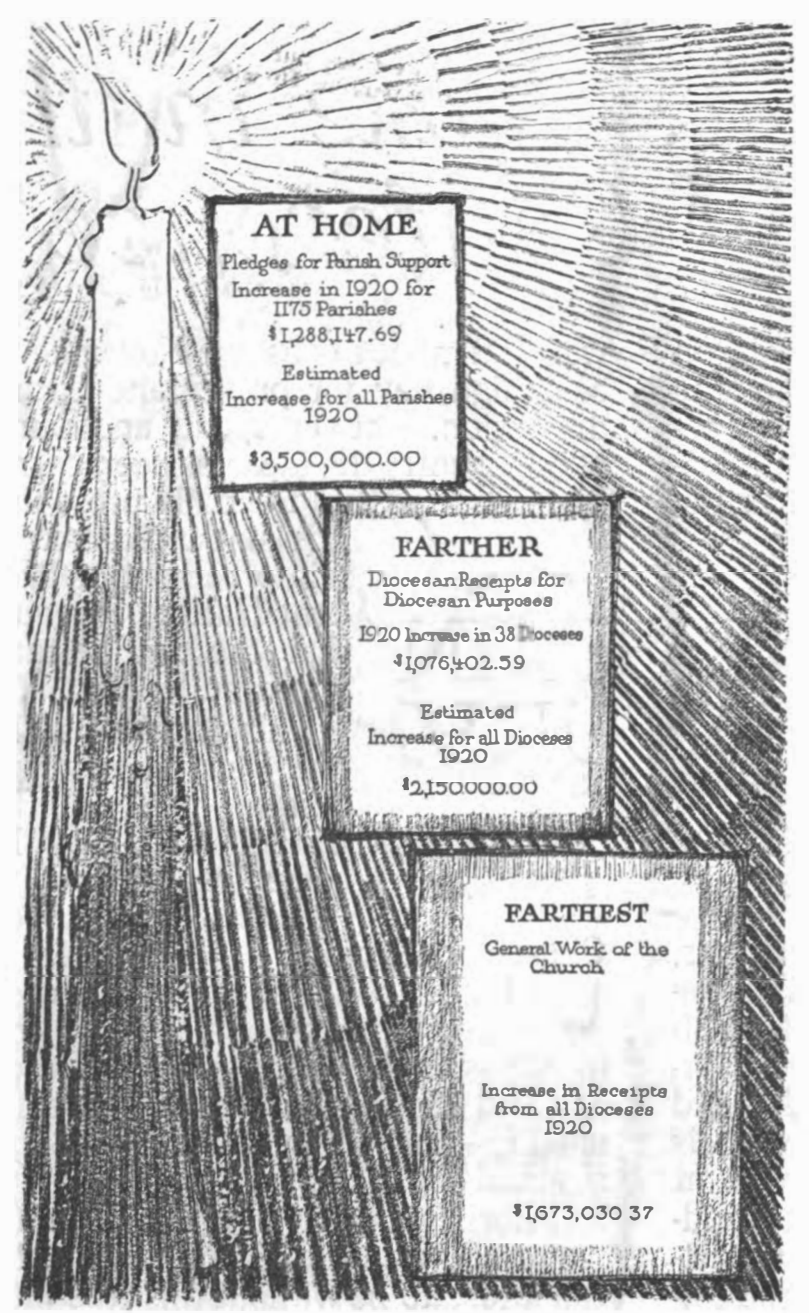
The Light That Shines Farthest Shines Brightest At Home.