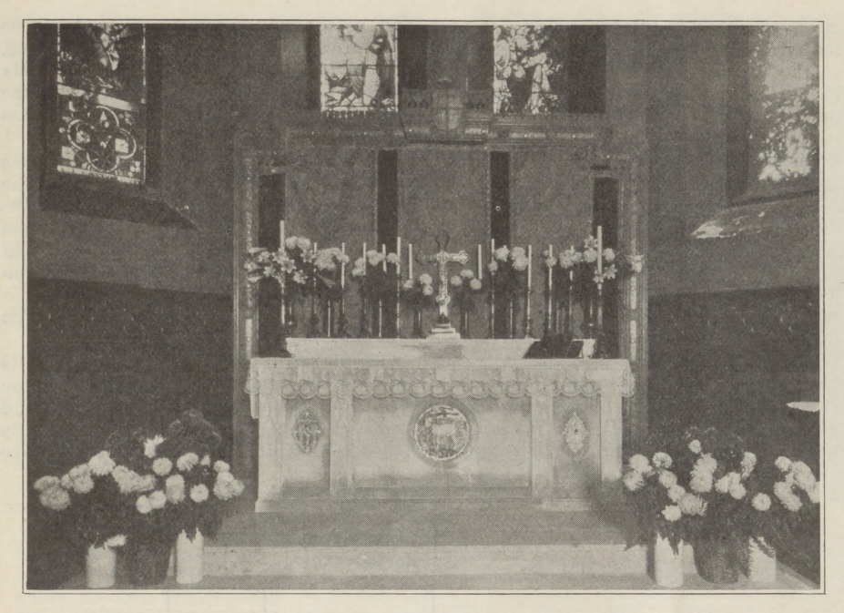
ALTAR, HOLY TRINITY CHURCH, WATERBURY, CONN. (to which reference was made in The Living Church Dec. 9th.)

and will be open to the colored persons | Corcoran Gallery of Art, at the annual from all the neighboring states.