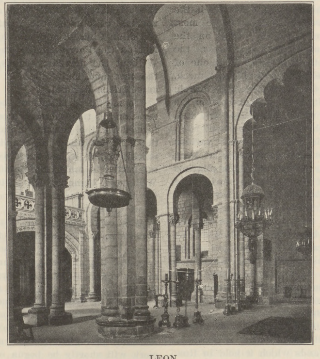
LEON Interior of the Cathedral,

From A Book of Social Prayers and Devotions, issued by the National Council.