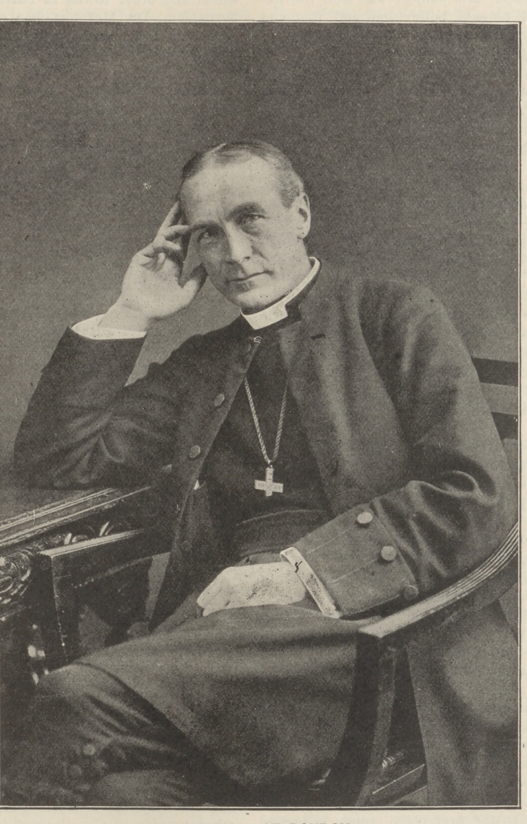
THE BISHOP OF LONDON

THE ALBERT HALL WAS crowded at the opening session in the afternoon. The Bishop of London managed to tear himself away from the National Assembly, and took the chair, supported by the Bishop of Zanzibar, the Metropolitan Eulogie, and many well-known ecclesiastics. The Bishop's presidential address was worthy of the occasion, but it is not possible to give more than the briefest of summaries.