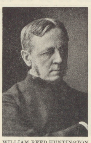
THE LIFE AND LETTERS