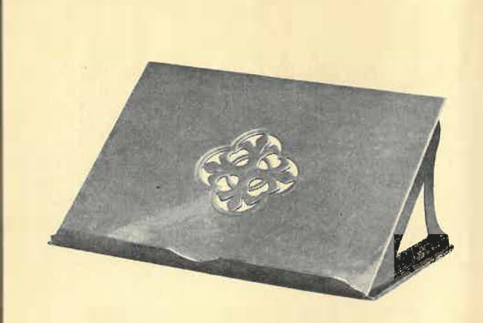
V4285—Altar Desk in small sizes. Back board approximately 11½ x 8.