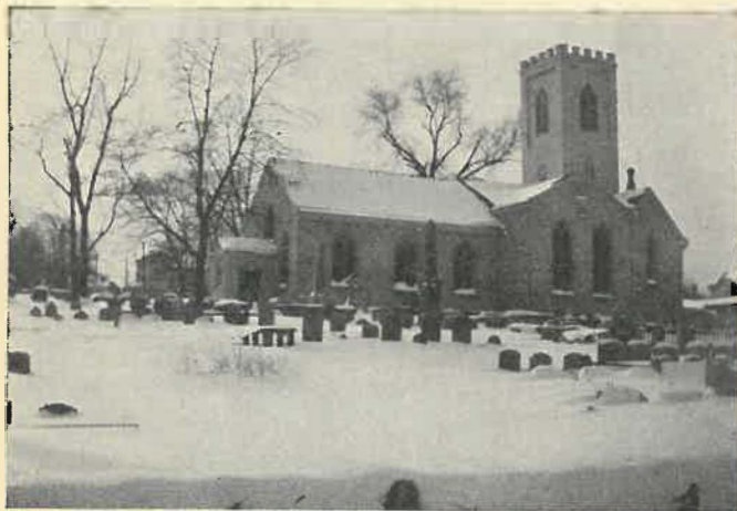
OLD SWEDES' CHURCH IN WINTER

beginnings in the days of the early Swedish colonists who arrived on the shores of the Delaware River before the advent of William Penn. They landed in 1637, on a spot at the mouth of a small creek emptying into the Delaware below Philadelphia. Their first act, after pressing the soil of the New World, was to praise God for His bountiful goodness. They named the colony New Sweden, and one of their earliest moves was to erect a church. This was finished in 1639.