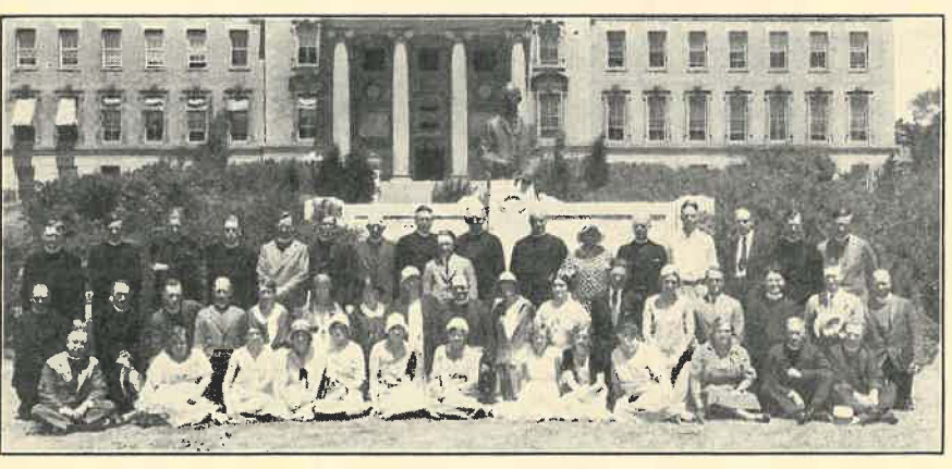
RURAL WORK CONFERENCE

The Church group at the ninth annual Rural Work Conference held in Madison, Wis., June 29th to July 10th.