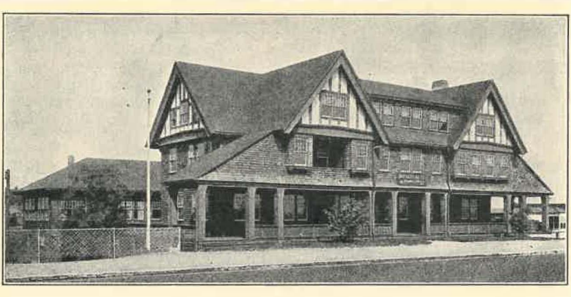
THE MOTHERS' REST

Some of us seem to think that we were born on an escalator, that we can go on progressing upward by simply standing still.—The late Charles N. Lathrop.