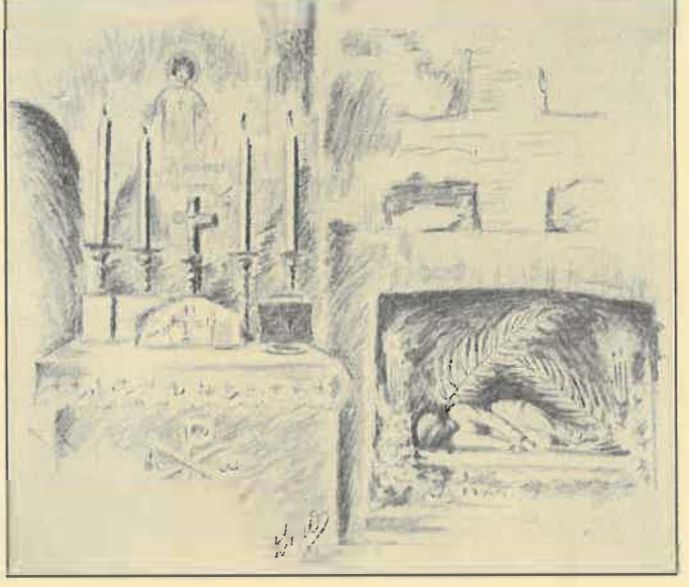
ST. CECILIA'S TOMB

The most thrilling of all the catacombs is that called after St. Calixtus. The Via Appia leads to it, hallowed by the blood of the saints. Along that road, according to the most beautiful of all Christian stories outside the Scriptures, appeared Christ to St. Peter, shortly before his martyrdom. There can be few who have not read, or seen upon the films, the story called