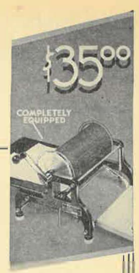
Send for 10-Day Trial Offer

"I Use the Lettergraph for Church Bulletins every week!"