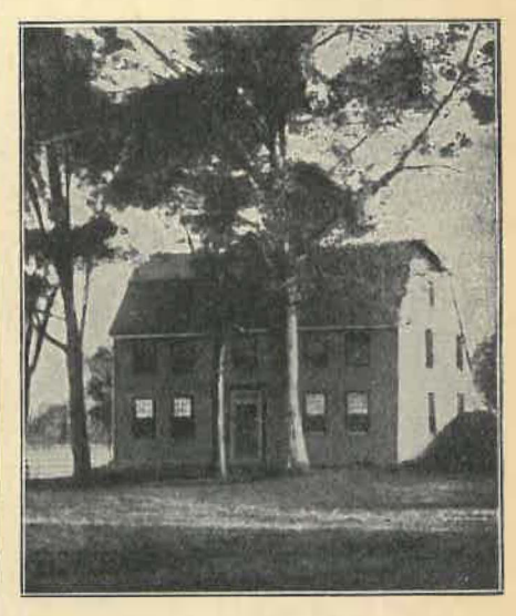
OLD GLEBE HOUSE

ver last September, the Hon. Burton Mansfield introduced a resolution in the House of Deputies for the appointment, by the Presiding Bishop and president of