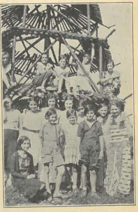
AT CAMP CHICKAGAMI

Each girl paid $1 registration fee and in addition brought foodstuffs as designated by Miss Robinson. Before the camp opened the meals were all planned for the entire three days, the quantities of food estimated and divided equally among the girls. The daughters of farmers provided the vege-