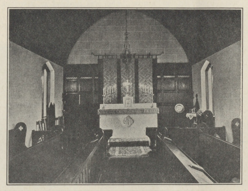
NEW MEMORIAL ALTAR IN TRINITY CHURCH, WOODBRIDGE, N. J.

That the Catholic faith is increasing in the parish is evidenced by the fact that a class of forty-five was recently presented for confirmation and the rector is now preparing another group.