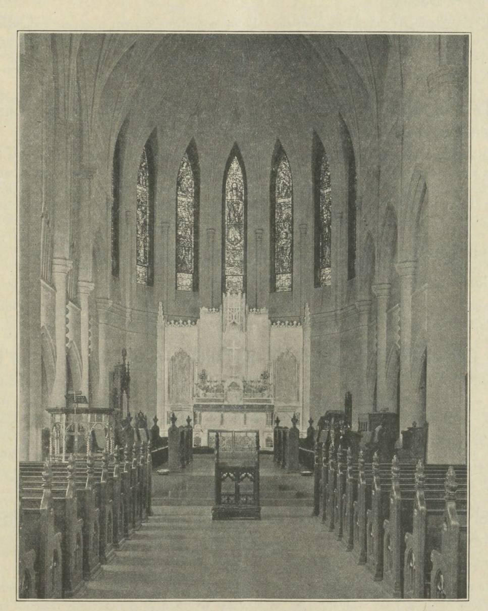
ALTAR, ST. MARY'S CATHEDRAL, MEMPHIS, TENNESSEE