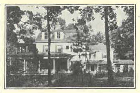
"MISSION BELLS INN"

"When giving of every sort is curtailed and directed primarily to human needs for