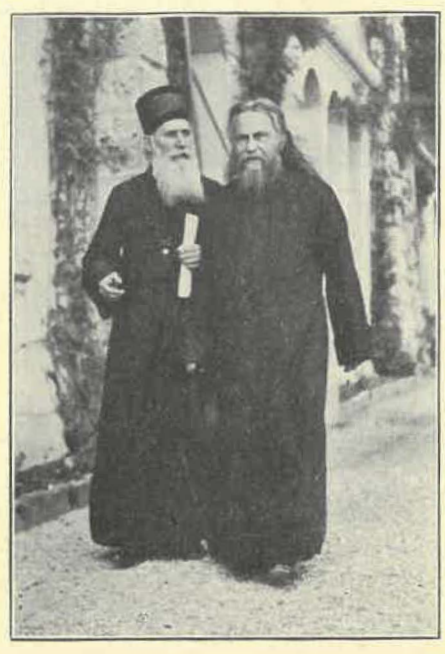
HALE SERMON PREACHER

A resolution to this effect, stating that it seems the question of whether the clergy shall serve as chaplains is to come up in General Convention, was unanimously adopted by the Auxiliary.