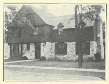
NEW STEVENS POINT, WIS., RECTORY

The new chancel was necessary because a severe storm last summer destroyed half of the east side of the church.