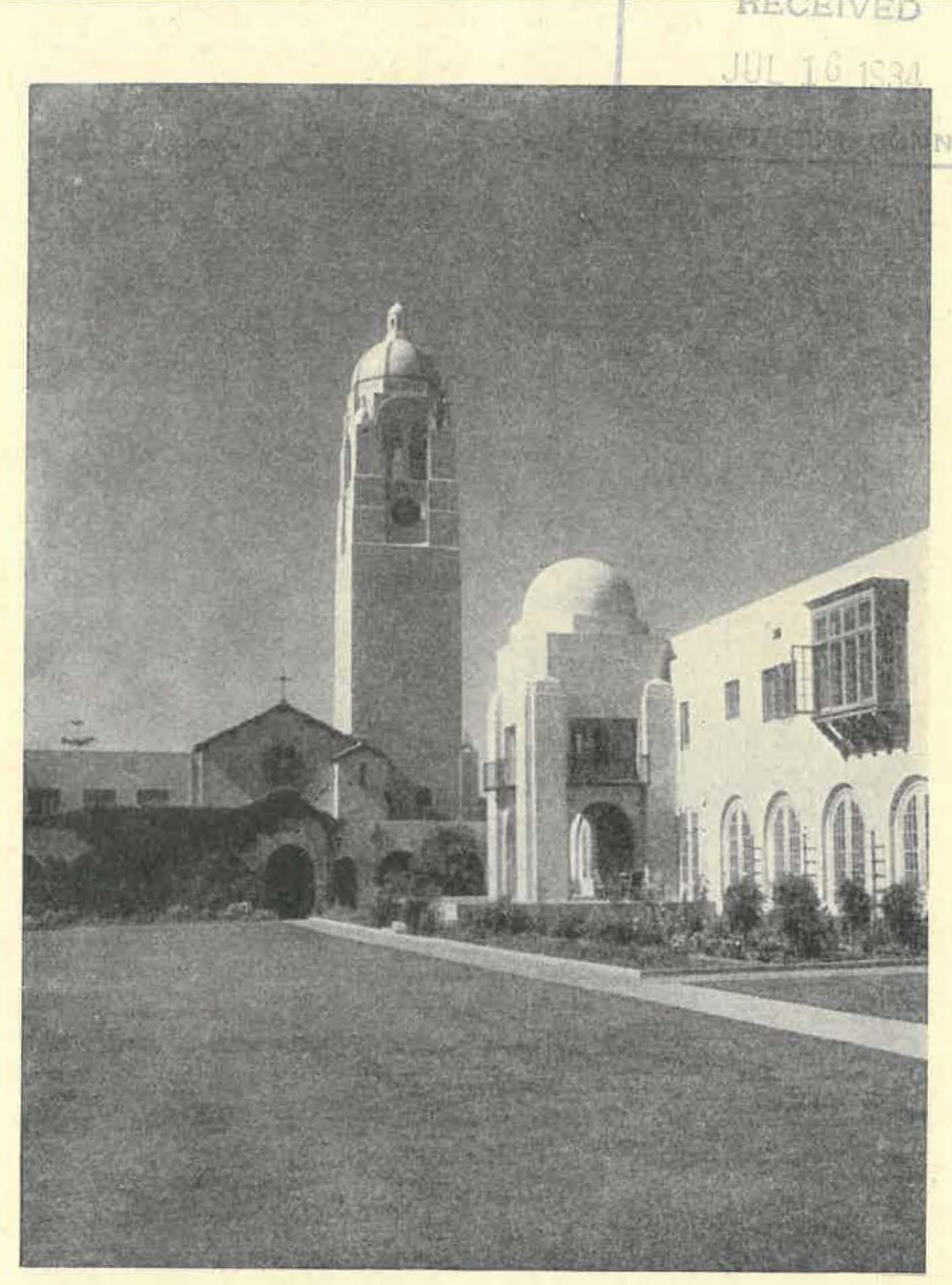
CHAPEL, THE BISHOP'S SCHOOL, LA JOLLA, CALIFORNIA