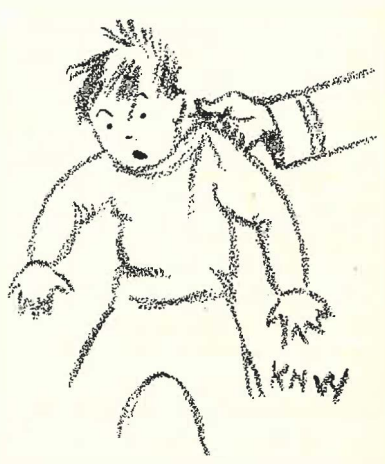
THE YOUNG OFFENDER

There is another step before the committee can set to work. Because of the immensity of the task and the great need for public approval of the work, the diocese ought to make a strong effort to enlist the aid of other Churches, of the welfare agencies in the diocese,