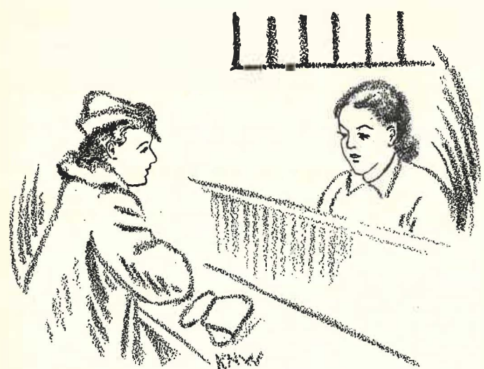
WHAT PROVISIONS . . . FOR WOMEN PRISONERS?

Like the ideal prison chaplain, this leader should have had thorough courses in social service work from a capable school. His important function would be the guiding of his co-workers