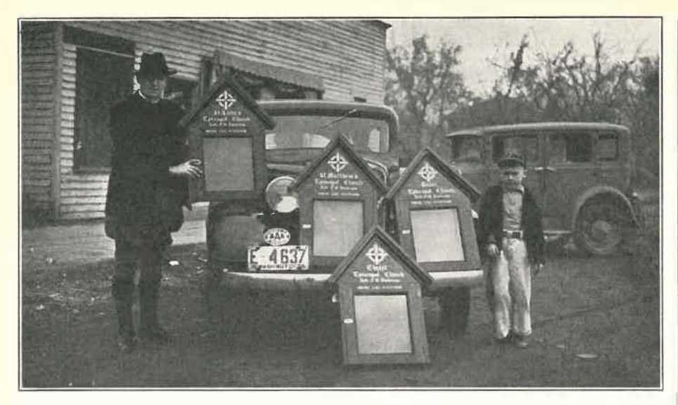
BULLETIN CABINETS, SUNNYSIDE, WASH.