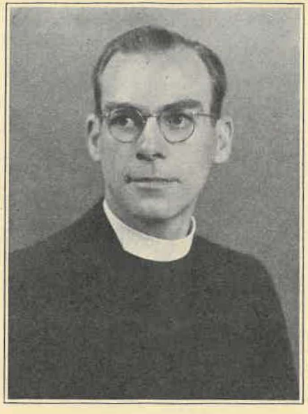
NEW U. W. CHAPLAIN

Bishop Perry will be the only representative of the Episcopal Church at the committee meeting.