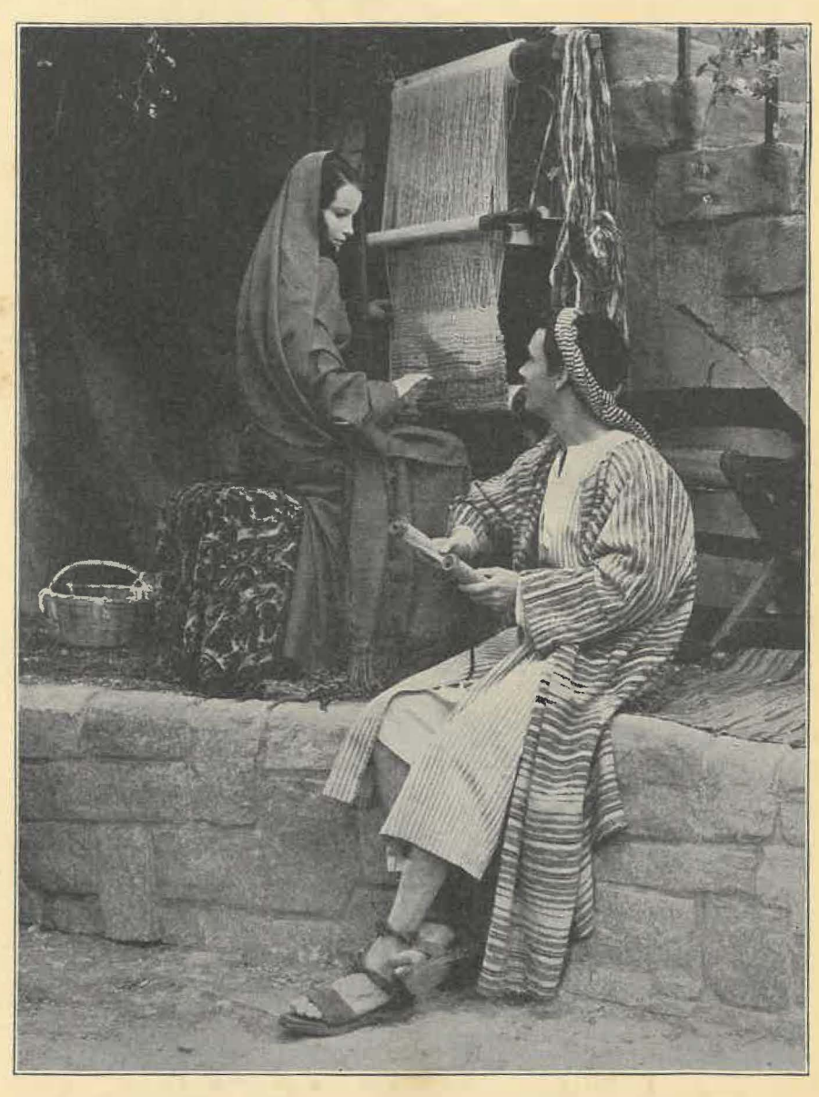
SCENE FROM "THE GREAT COMMANDMENT"

Tamar and Joel, two Jewish young people of the time of Christ are shown in the above picture from "The Great Commandment," a new religious movie which will be released soon.