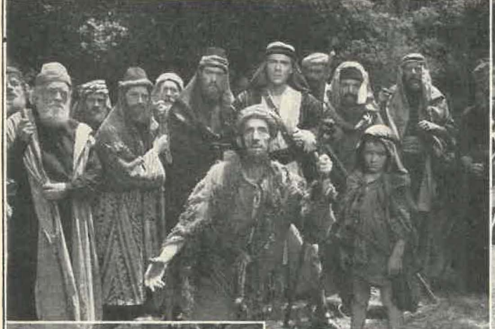
Roman soldiers enter the village to proclaim and enforce the collection of a new tax imposed on the people of Judea because of the recent revolts against Rome. Without conscious intention, the picture suggests a parallel with present-day struggles of oppressed masses against dictatorial rule.