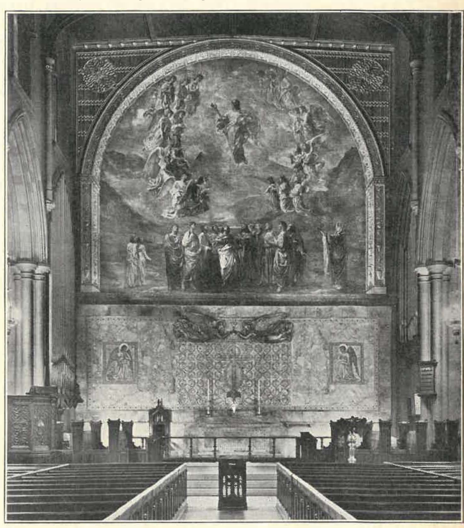
LA FARGE CHANCEL: It marked an advance toward beauty in worship.