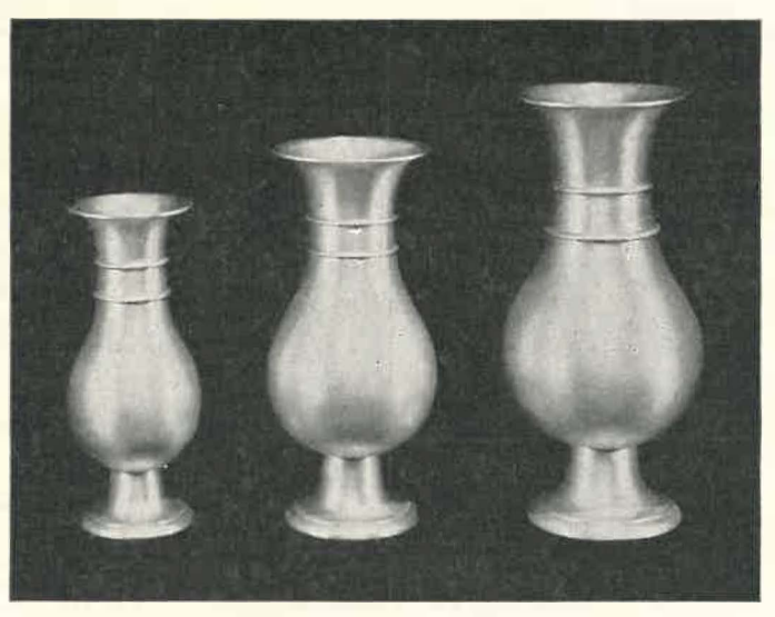
COPIES OF AN IMPORTED VASE

No. 609—BRASS 9" High..........$22.00 pr. 10½" High........$30.00 pr. 12" High..........$36,00 pr.